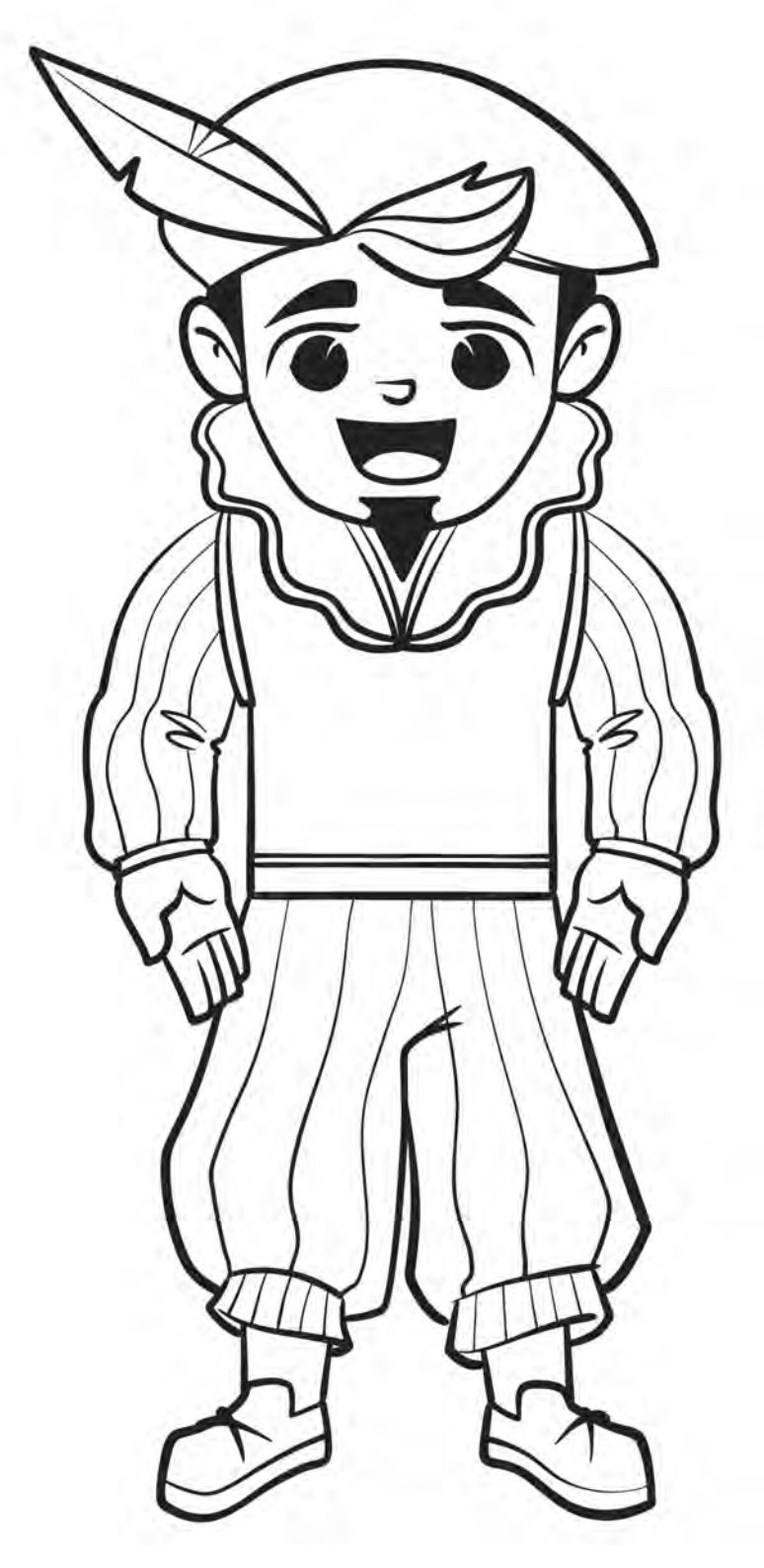
Kingsmen Shakespeare Educational Tour 2021 Home Materials Packet © 2021 Kingsmen Shakespeare Company