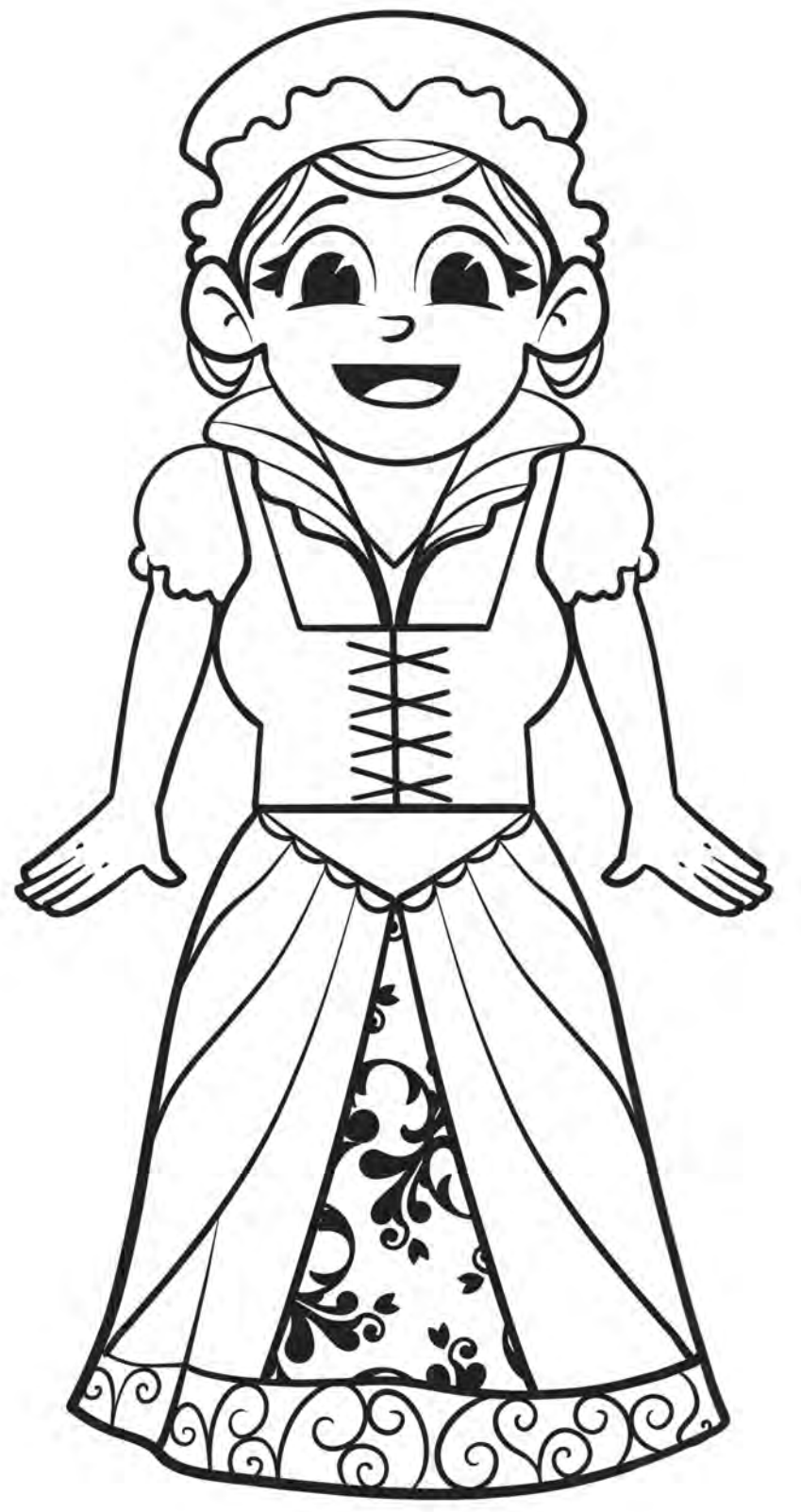
Kingsmen Shakespeare Educational Tour 2021 Home Materials Packet © 2021 Kingsmen Shakespeare Company