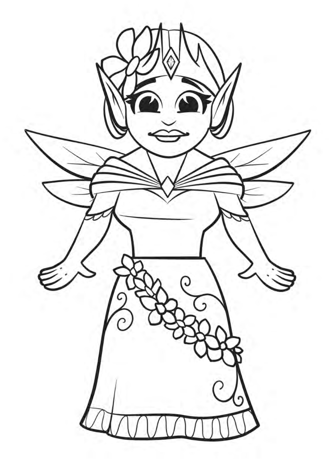
Kingsmen Shakespeare Educational Tour 2021 Home Materials Packet © 2021 Kingsmen Shakespeare Company