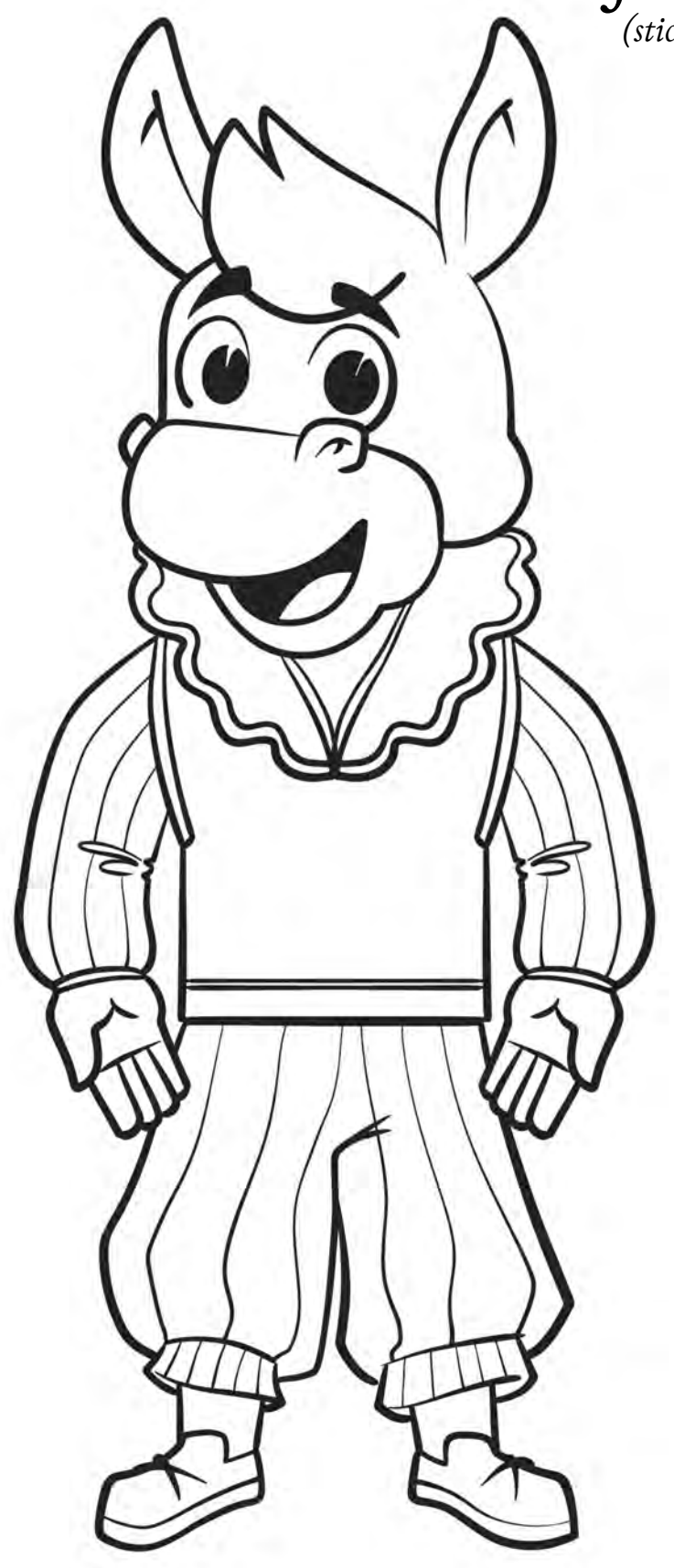
Kingsmen Shakespeare Educational Tour 2021 Home Materials Packet © 2021 Kingsmen Shakespeare Company