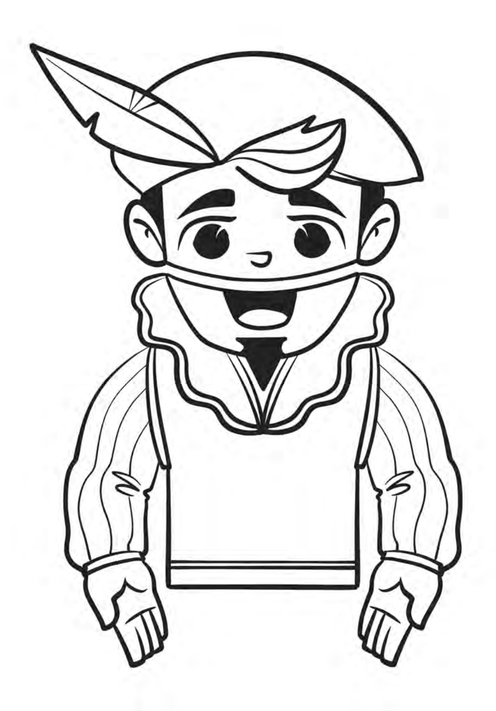
Kingsmen Shakespeare Educational Tour 2021 Home Materials Packet © 2021 Kingsmen Shakespeare Company