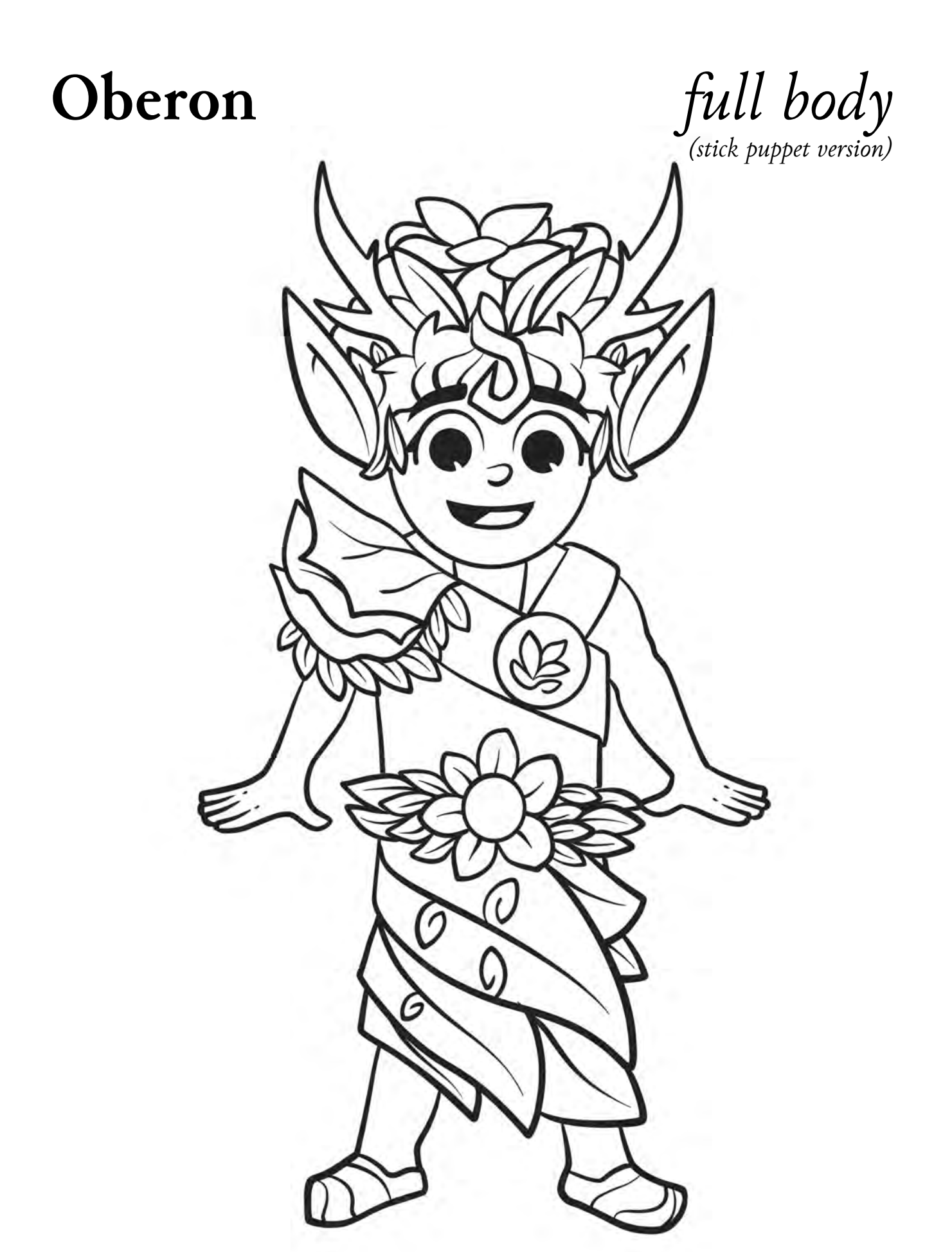
Kingsmen Shakespeare Educational Tour 2021 Home Materials Packet © 2021 Kingsmen Shakespeare Company